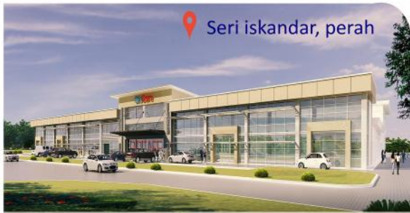
Seri Iskandar, perah